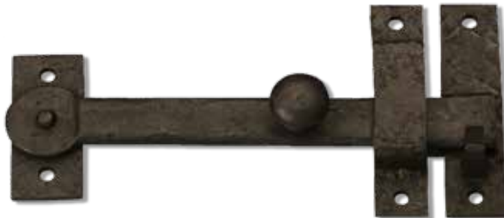
50-125 Drop Bar no Knob Bar 7-1/2" Catch Plate 3-3/4" x 1"