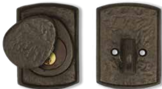
30-110 Deadbolt Arch 2-1/2" x 3"