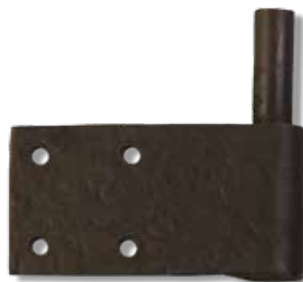
20-252 Jam Pintle Plate 2-1/2" x 4-3/4" - 1/4" Thick Right and Left Hand Available