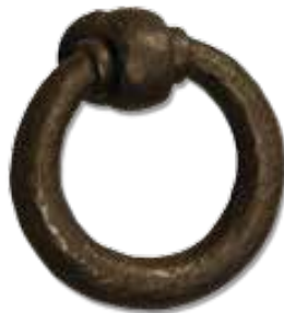
50-Ring 3-1/2" Diameter 2-1/4" Proj.