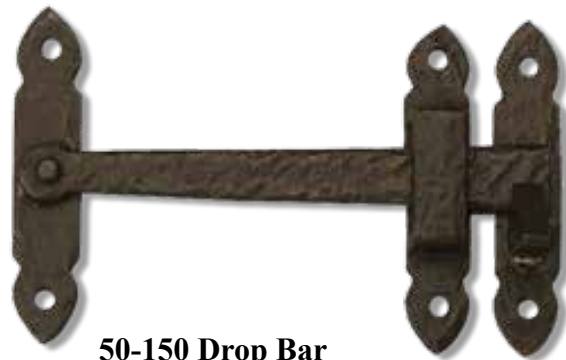
50-150 Drop Bar Bar 6-1/2" Catch Plate 4" x 3/4"