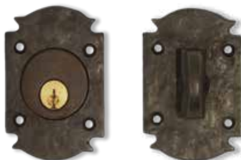
30-275 Patio Deadbolt Euro 30-252 Patio Bolt Euro 2" x 3"