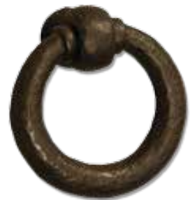
50-Ring 3-1/2" Diameter 2-1/4" Proj.