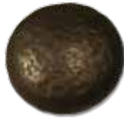
70-Small Mushroom Knob 2" 2-1/2" Proj.