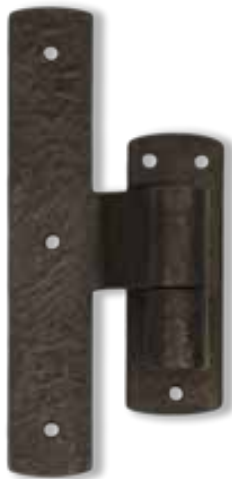
70-620 - 1-1/4" Offset 70-625 - 2-1/4" Offset T-Hinges