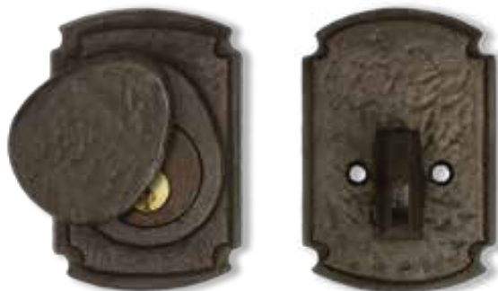
30-120 Deadbolt Euro 2-1/2" x 3"