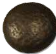
75-Large Mushroom Knob 2-1/4" 2-1/2" Proj.