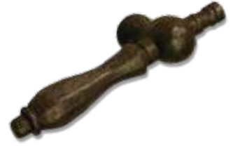
40-Octagonal 6" Lever 3" Proj.