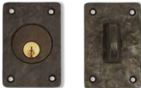
30-265 Patio Deadbolt Square 30-250 Patio Bolt Square 2" x 3"