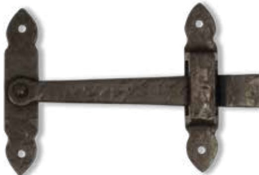
50-130 Reverse Drop Bar Bar 6-1/2" Catch Plate 2-7/8" x 1" x 1/2"